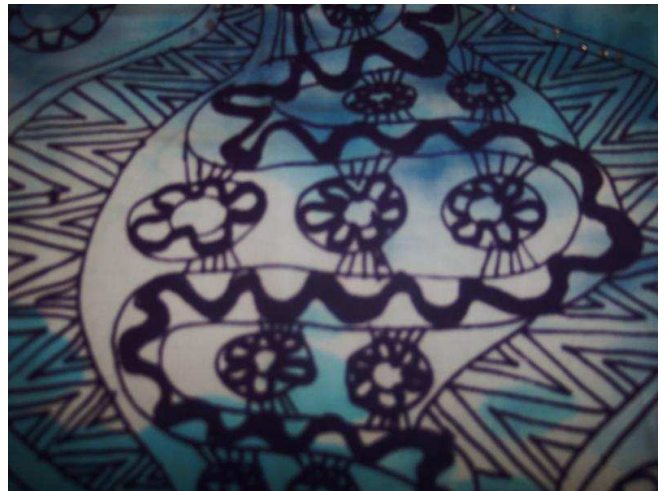
Photo emulsion screens are used by semi professionals, craft workers, teachers and anyone who needs a design permanently on a screen.

Course Outcome: In this 8 hour workshop students will produce a photo emulsion screen for multiple printing. This screen has advantage over the stencil printing by allowing much more fine detail in the design to be printed and has a life of up to 1000 prints.